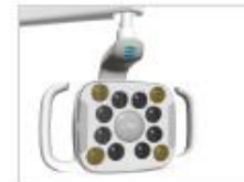
572L dental light