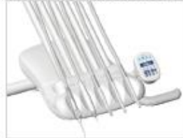
335 Continental delivery system