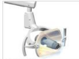
571 dental light (shown)