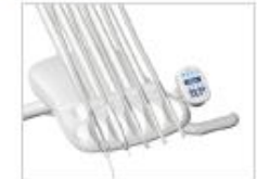
333 Continental delivery system