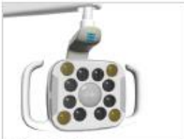
571L dental light