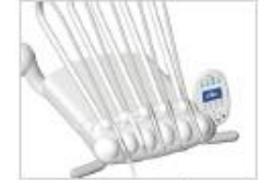
533 Continental delivery system (shown)