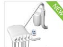
336 Traditional delivery system