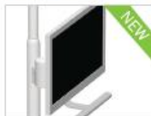
381 monitor mount