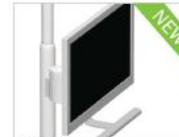
381 monitor mount (mounts to light post)