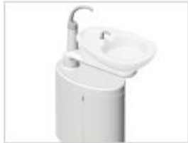
461 support center/cuspidor

Products that are connected to the back-mount of the chair.