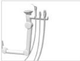
551 assistant's instrumentation (shown with 461, compatible with or without cuspidor)