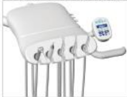
334 Traditional delivery system (shown)