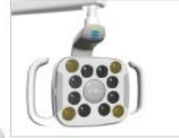
572L dental light (shown)