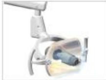
571 dental light (shown)