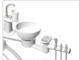
353 cuspidor-mounted assistant's instrumentation