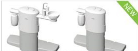
363 post-mounted support center with cuspidor (shown) or without cuspidor

Products that are connected to the side-mount of the chair. Left or right option is available.