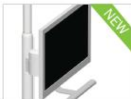
381 monitor mount (mounts to light post) (shown)