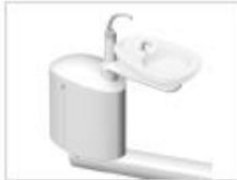
561 support center/cuspidor (compatible with or without cuspidor)