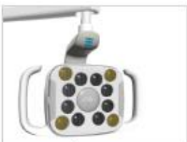
571L dental light