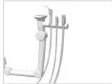
551 assistant's instrumentation (shown)