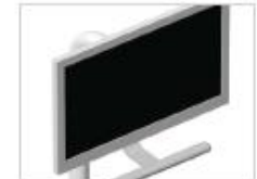
382 monitor mount