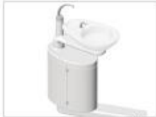
461 support center/cuspidor

Products that are connected to the back-mount of the chair.