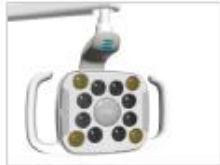
571L dental light