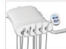
332 Traditional delivery system