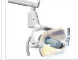
572 dental light