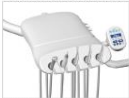
334 Traditional delivery system