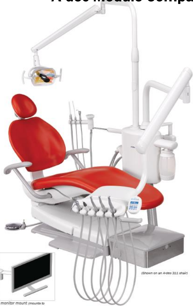
(Shown on an A-dec 311 chair)