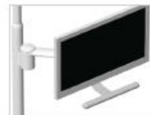
482 monitor mount (shown)