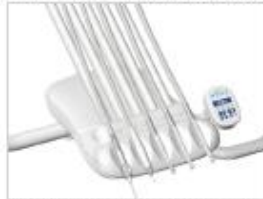
335 Continental delivery system (shown)