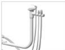
351 assistant's instrumentation (not compatible with cuspidor)