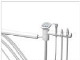
352 telescoping assistant's instrumentation