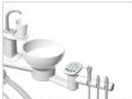
353 cuspidor-mounted assistant's instrumentation (shown)