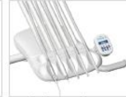
333 Continental delivery system