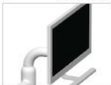
581 monitor mount (shown)