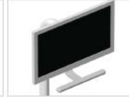
382 monitor mount