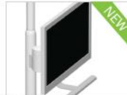
381 monitor mount (mounts to light post)