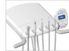
532 Traditional delivery system