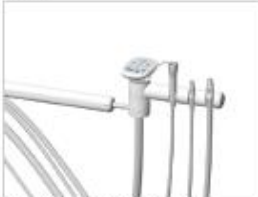
352 telescoping assistant's instrumentation (shown)