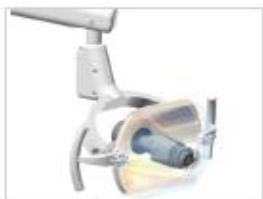
571 dental light (shown)