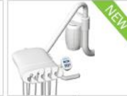
336 Traditional delivery system