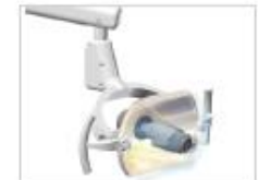
572 dental light