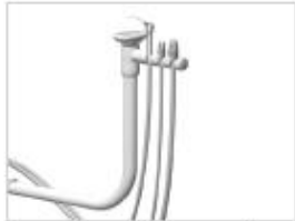
351 assistant's instrumentation (not compatible with cuspidor)