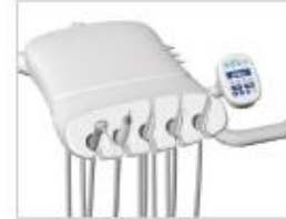
332 Traditional delivery system (shown)