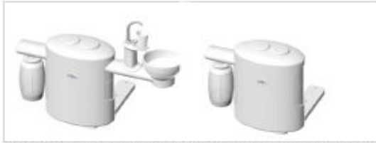
362 post-mounted support center with cuspidor or without cuspidor (shown)

Products that are connected to the side-mount of the chair. Left or right option is available.