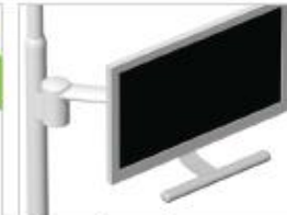
482 monitor mount (mounts to light post)