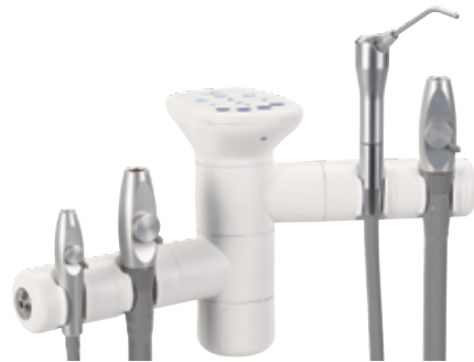
Dual 2-position holder