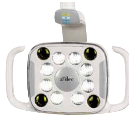
A-dec 500 LED