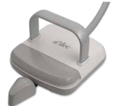
Lever foot control