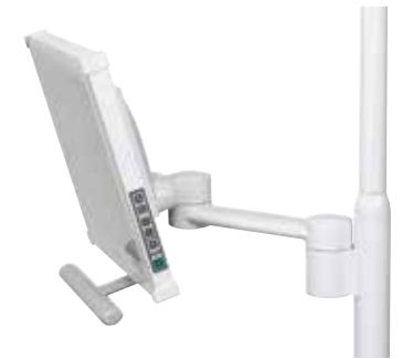
Light post monitor mount with link arm