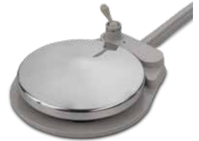
Disc foot control