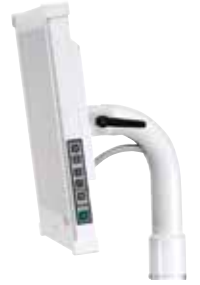
Radius monitor mount