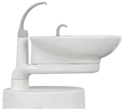
Rotating vitreous china cuspidor