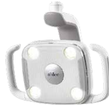
A-dec 300 LED