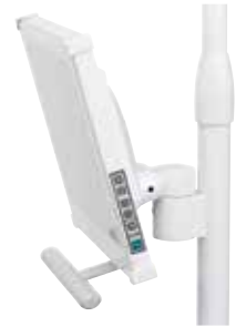
Light post monitor mount