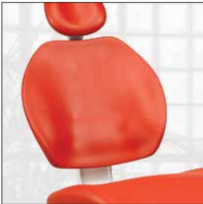
Formed upholstery without armrests