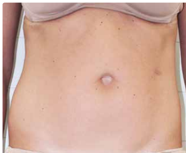
35 days after the 2 nd session.