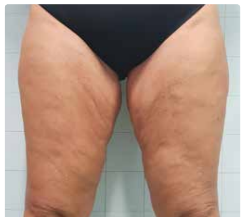
60 days after 1 single session.