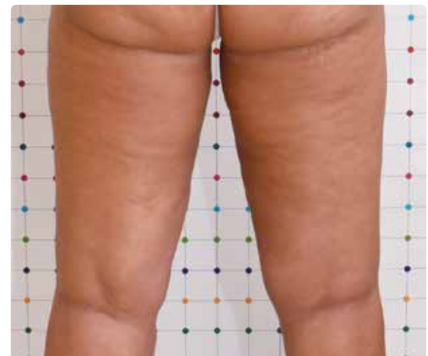
Follow-up after the 3 rd session.