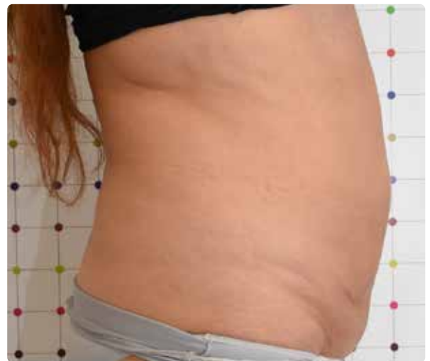
45 days after 1 single session.