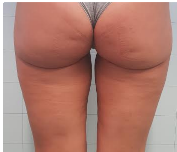
30 days after 1 single session.