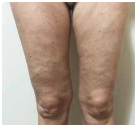
Follow-up after the 1 st session.