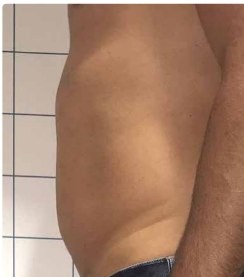
Follow-up after the 2 nd session.