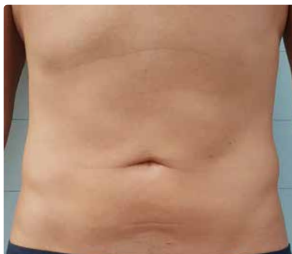
30 days after the 3 rd treatment.