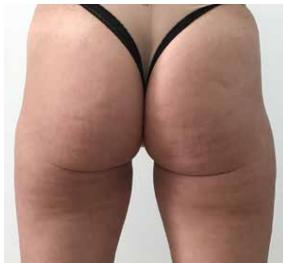
30 days after 1 single session.