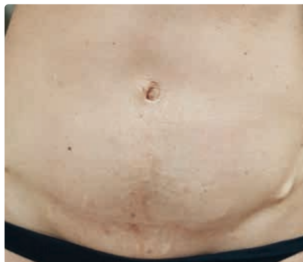
30 days after 1 single session.