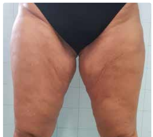
30 days after 1 single session.