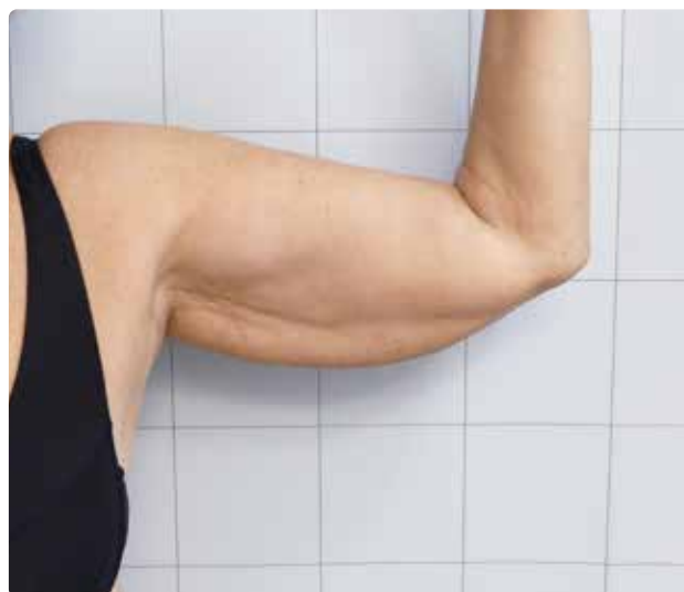
Follow-up after the 3 rd session.