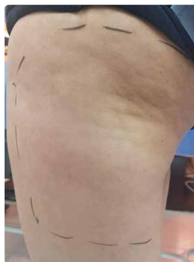
Before treatment. The "hole" visible under the left buttock is due to the muscle contraction requested by the doctor to her patient.

* Database Onda protocols refer to a 15x15 cm treatment area – unless otherwise stated. In a single session could be treated 1 or more 15x15 squares according to single patient needs.