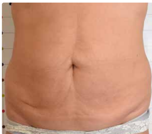
45 days after 1 single session.