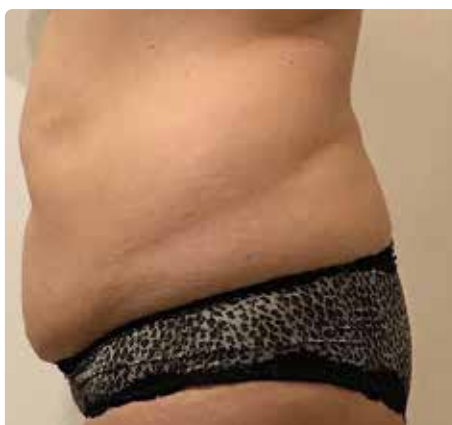
Follow-up after the 2 nd session.