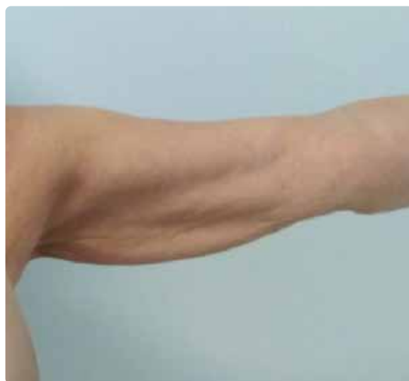
Follow-up after the 2 nd session.