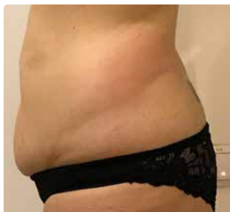
Follow-up after the 3 rd session.