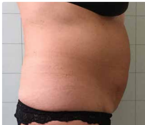
30 days after the 3 rd treatment.