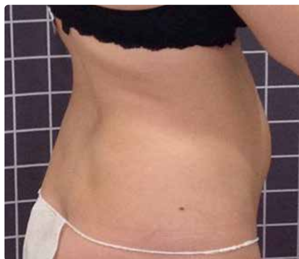
30 days after 1 single session.