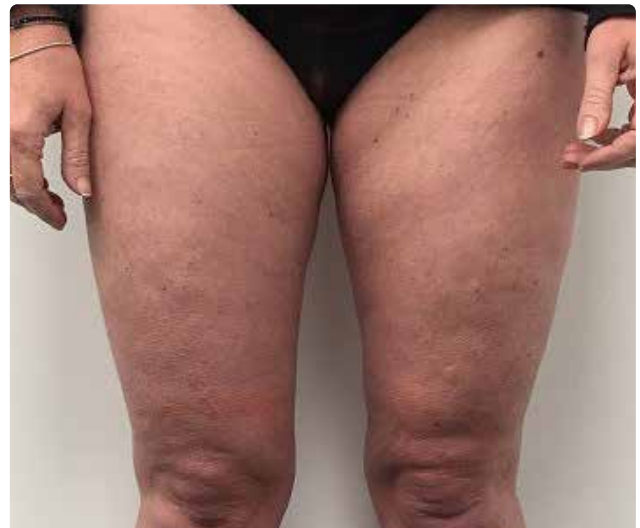
Follow-up after the 2 nd session.