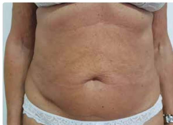
60 days after 1 single session.