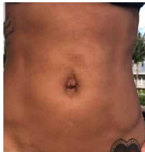
60 days after 1 single session.