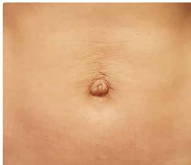
30 days after the 3 rd treatment.