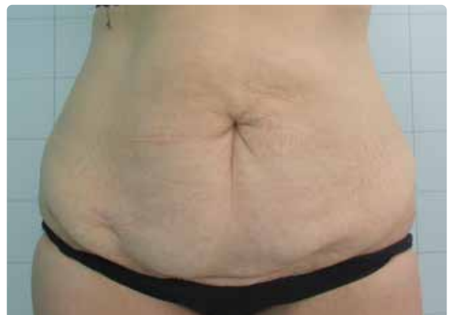
Follow-up after the 2 nd session.