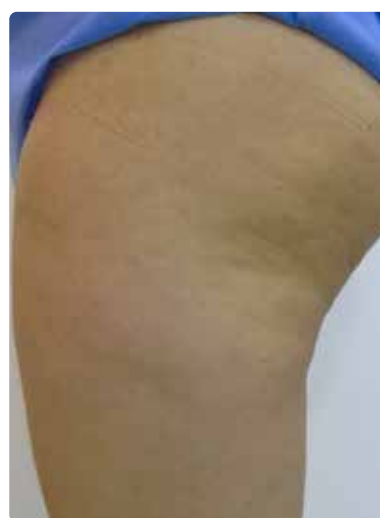
5 months after 1 single session. It is possible to observe an important reduction of the "hole" under the left buttock when the doctor asked to her patient to contract the muscle.