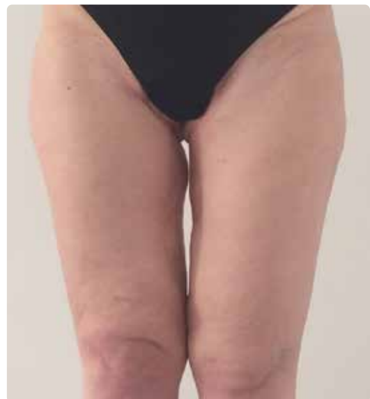
Follow-up after the 3 rd session.