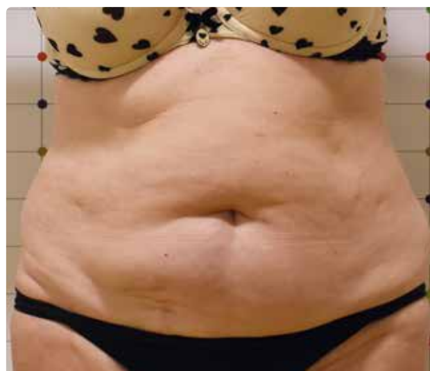
30 days after the 2 nd session.

* Database Onda protocols refer to a 15x15 cm treatment area – unless otherwise stated. In a single session could be treated 1 or more 15x15 squares according to single patient needs.