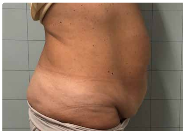
30 days after the 3 rd treatment.