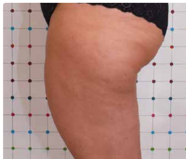
Follow-up after the 4 th session.