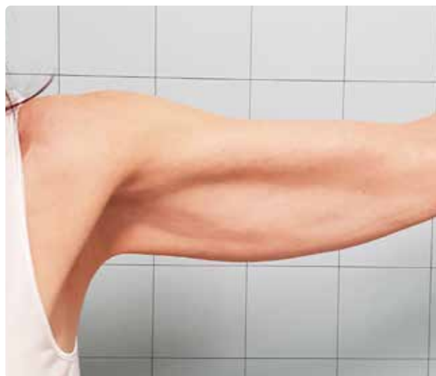
30 days after the 3 rd treatment.