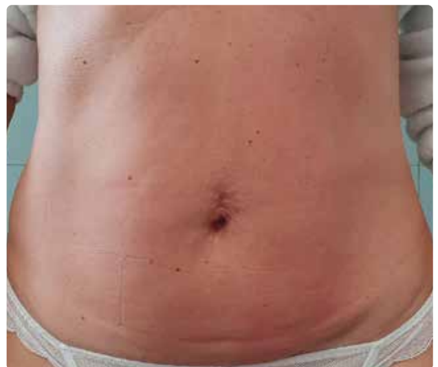
30 days after the 4 th treatment.