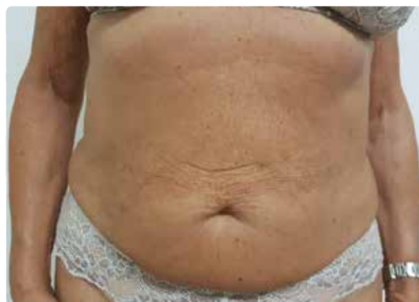
30 days after 1 single session.