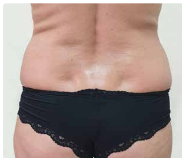
30 days after the 2 nd session.