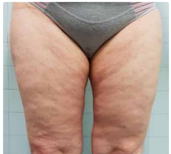
30 days after the 4 th session.