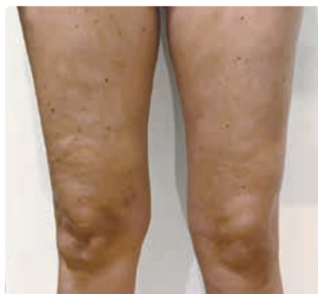
Follow-up after the 2 nd session.