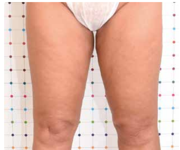
Follow-up after the 3 rd session.