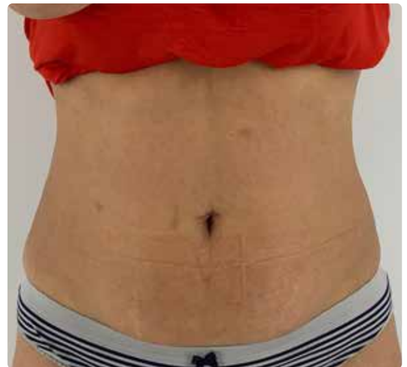
45 days after 1 single session.