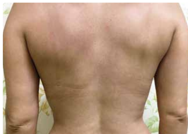
90 days after 1 single session.