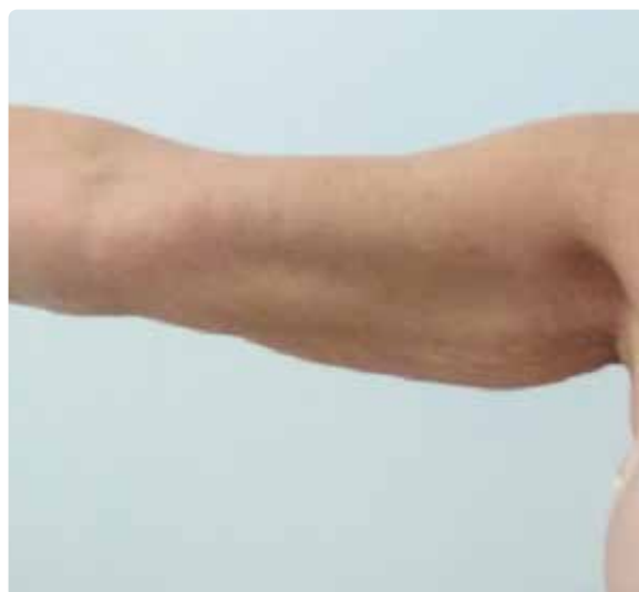
Follow-up after the 2 nd session.