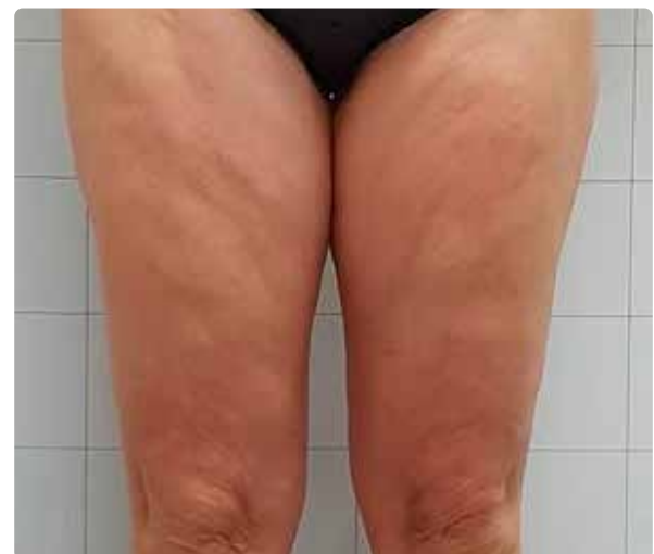
60 days after the 2 nd treatment.