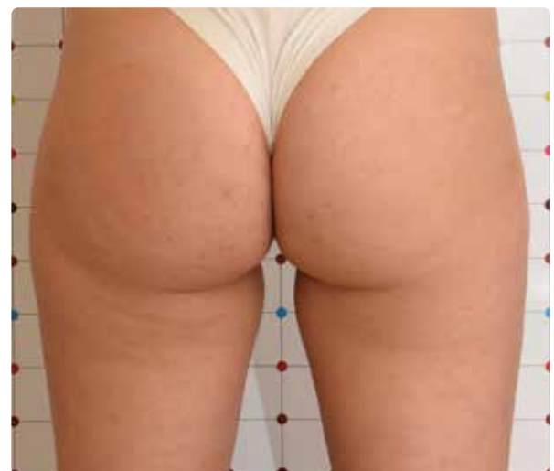
35 days after the 2 nd session.